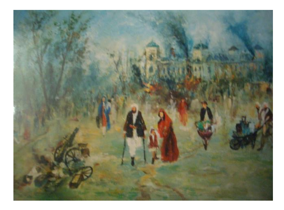
War in Darlaman Kabul Oil color on canvas paper, 9 x 12 in.